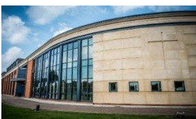
Bluecoat Aspley Academy

The growth of the Trust is a truly exciting time for prospective candidates who are looking to further their careers in a dynamic learning community that has opportunity at every point to share and learn from each other in order to become the best that we can be.