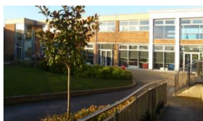
Bluecoat Beechdale Academy