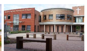
Nottingham Emmanuel School