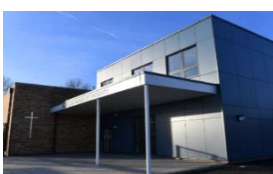
Bluecoat Primary Academy