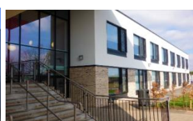
Bluecoat Wollaton Academy