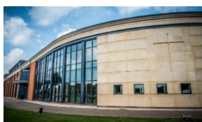
Bluecoat Aspley Academy

The growth of the Trust is a truly exciting time for prospective candidates who are looking to further their careers in a dynamic learning community that has opportunity at every point to share and learn from each other in order to become the best that we can be.