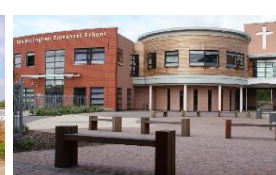
Nottingham Emmanuel School