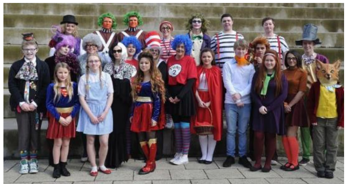
World Book Day 2016