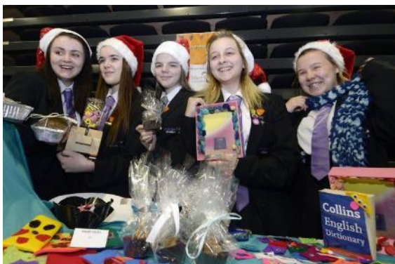
Charity Christmas Craft Fair

Furness Academy also has a strong sense of social responsibility, therefore, alongside the above events we hold a number of charity events throughout the year that our staff and students actively participate in. These include sponsored walks, funfairs, craft fairs and coffee mornings.