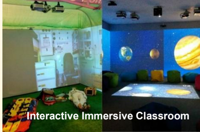
Interactive Immersive Classroom