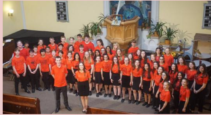
This year's Concert Tour took place in Prague, Czechia, and was enjoyed by students from Years