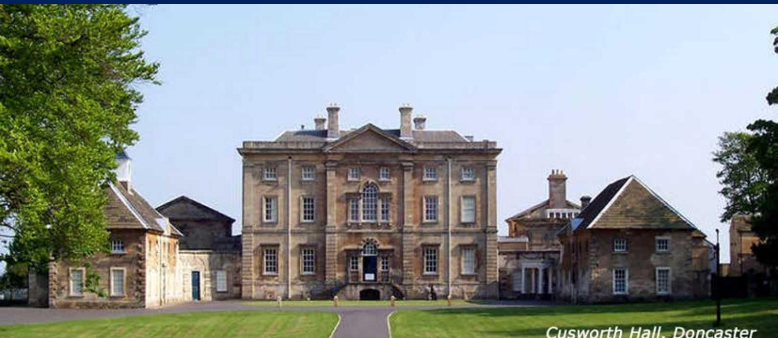
Cusworth Hall, Doncaster