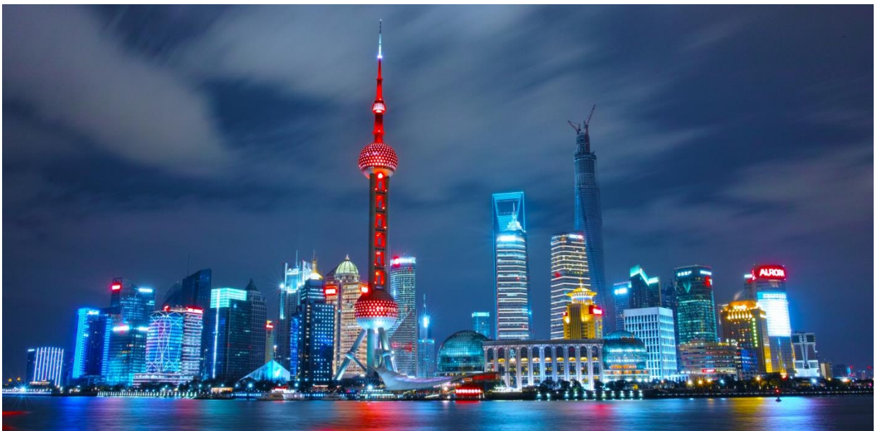
The Pudong Skyline