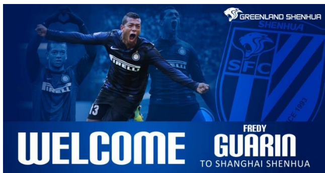
A Shanghai Shenhua Poster in 2016

Shanghai is the hometown of many outstanding and well-known Chinese professional athletes, such as Yao Ming, the 110-meter hurdler Liu Xiang, the table-tennis player Wang Liqin and the former world women's single champion and current Olympic silver medalist badminton player Wang Yihan.