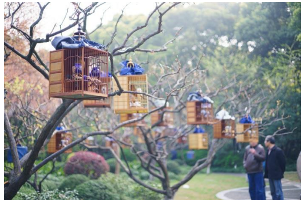
Morning Park View