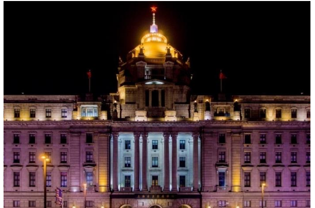
A building on the Bund