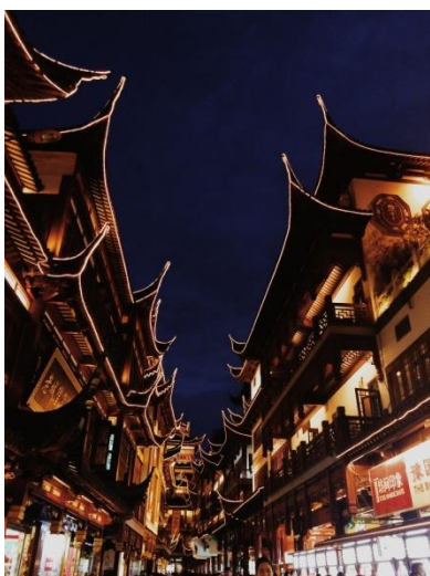
City God Temple

Due to its cosmopolitan history, Shanghai has a blend of religious heritage as shown by the religious buildings and institutions still scattered around the city. According to a 2012 survey only around 13% of the population of Shanghai belongs to organised religions, the largest groups being Buddhists with 10.4%, followed by Protestants with 1.9%, Catholics with 0.7% and other faiths with 0.1%. Around 87% of the population may be either irreligious or involved in worship of nature deities and ancestors, Confucian churches, Taoism and folk religious sects.