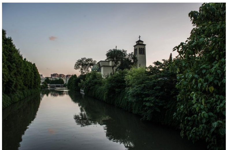
Catholic Country Church, Shanghai