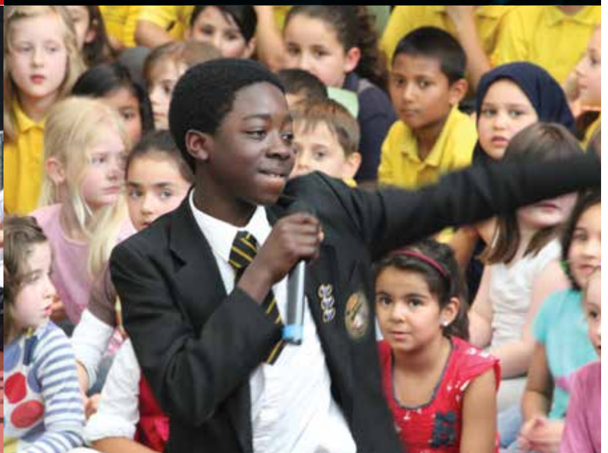
Musical performance with the BBC orchestra