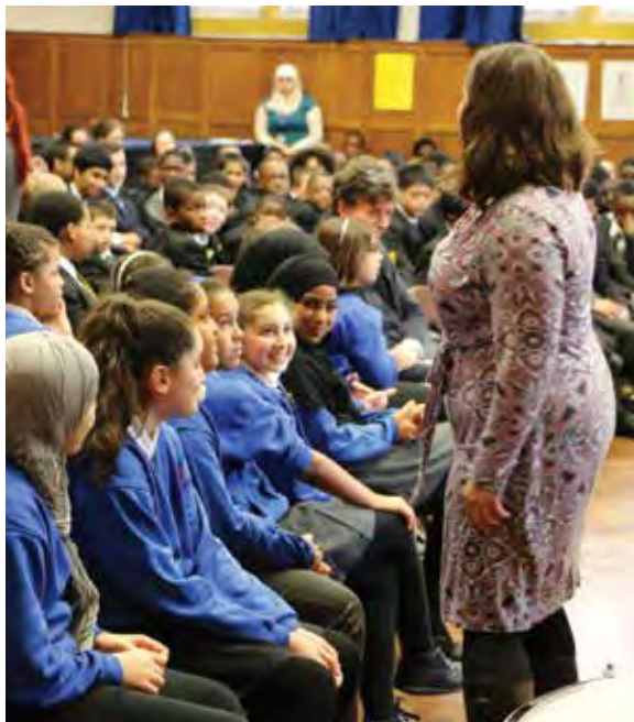
The English National Opera performs in our main hall

We encourage and support staff who are willing to involve themselves and organise clubs and extra-curricular trips for our pupils. The school has its own Army Cadet Detachment which parades every week and provides opportunities for pupils to take part in outdoor pursuits, camps and related activities.