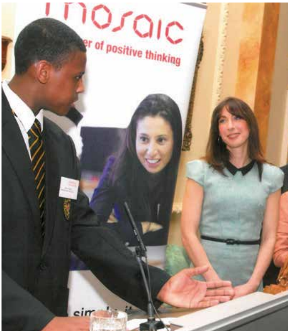
Pupils invited to 10 Downing Street