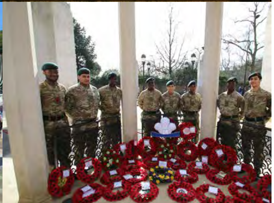
Army cadets attending a memorial service in London