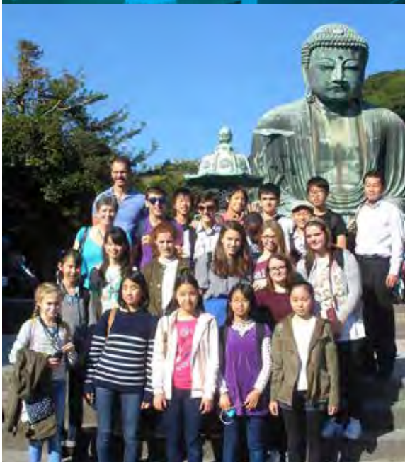
Japanese exchange trip