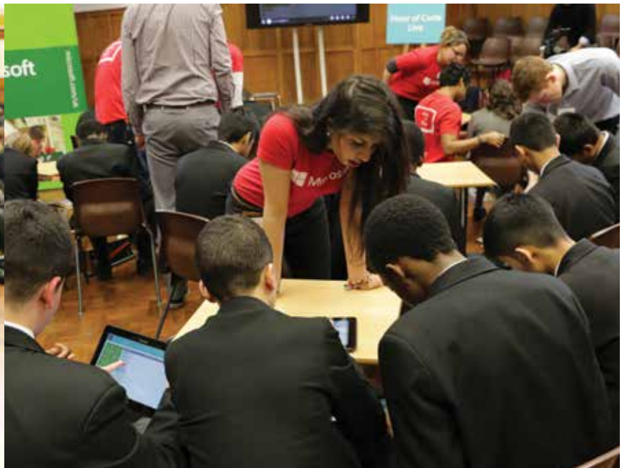
Pupils participating in the Hour of Code launch event with Microsoft