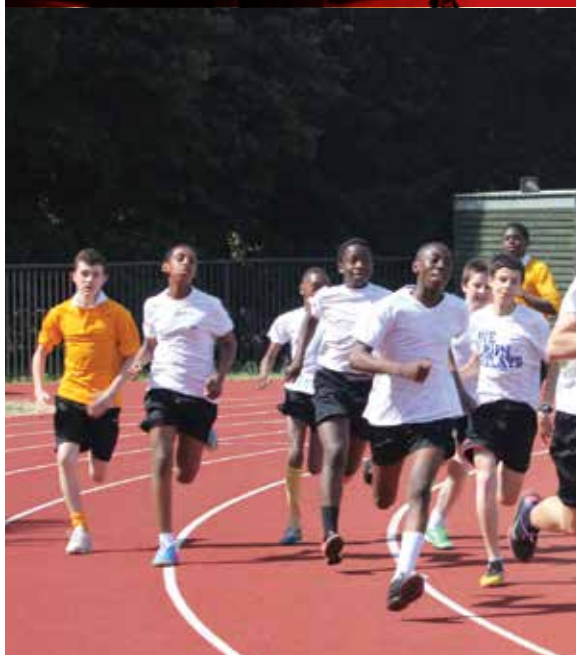
Sports Day at Battersea Park Arena