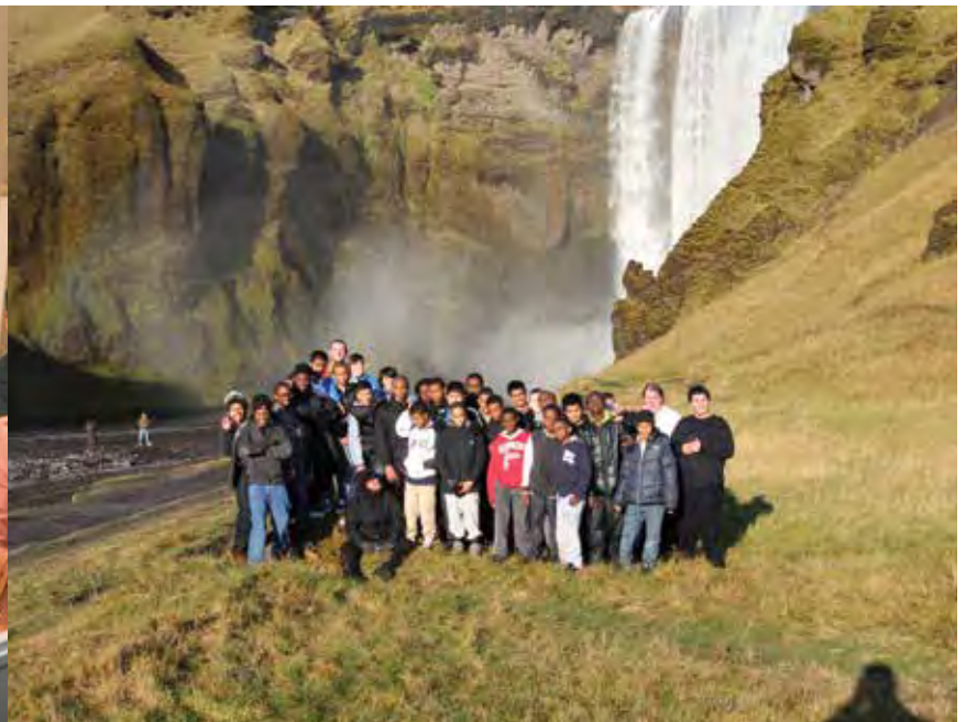
Geography field trip to Iceland