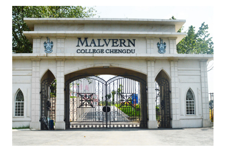
"When I arrived in Malvern I was struck by its beautiful landscape and its rich culture. The Malvern Hills reminded me of my native France which was comforting. Teaching at Malvern College is a dream come true as the pupils are responsive and engaging and colleagues are supportive and caring." – Teacher of MFL