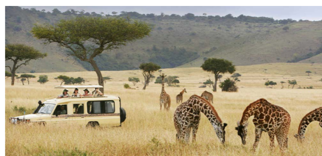
With parks like the Nakuru National Park and the Maasai Mara as well as perfect beaches and stunning mountains, Kenya offers a rich natural and cultural experience.