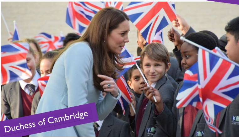
Duchess of Cambridge