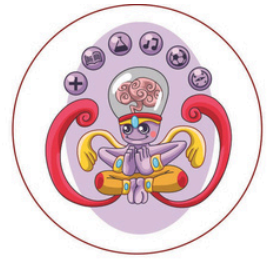
Flexibility of Mind