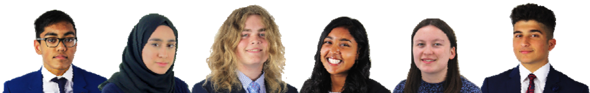
Our Head Prefect Team: 2019 - 2020