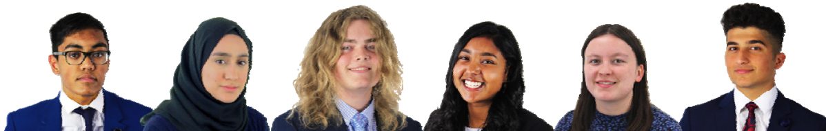
Our Head Prefect Team: 2019 - 2020

Closing date: Wednesday 11 December 2019 at 9.00 am