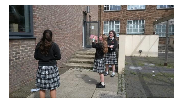
There are spaces around school which can be booked and utilised for alternative style lessons.