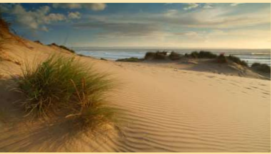
Nearby at Saunton Sands

A Community Sports Hall is managed by the school. A floodlit artificial turf pitch on the school site benefits both the school and the community. Further sporting facilities have been developed, including a newly refurbished floodlit regional netball centre of six courts.