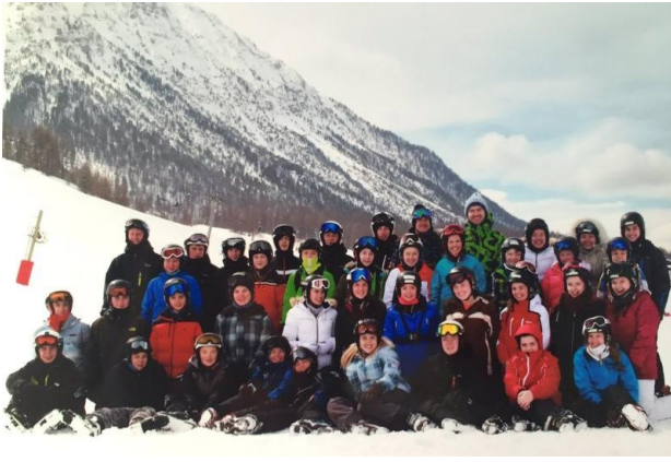
Ski Trip 2016