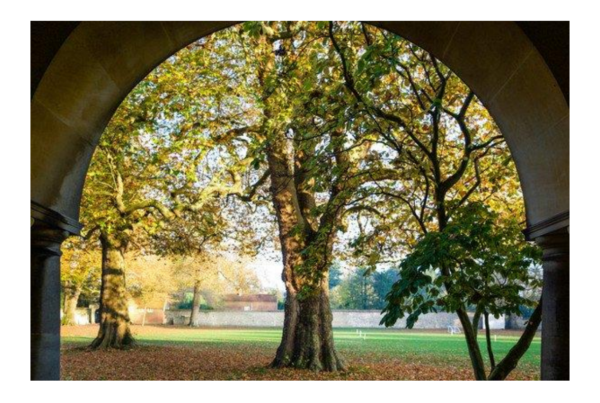
"Winchester is a place where you can make things happen"

This unparalleled combination attracts pupils from across the world, making Winchester a truly international community which celebrates every pupil's individuality, passions and potential.