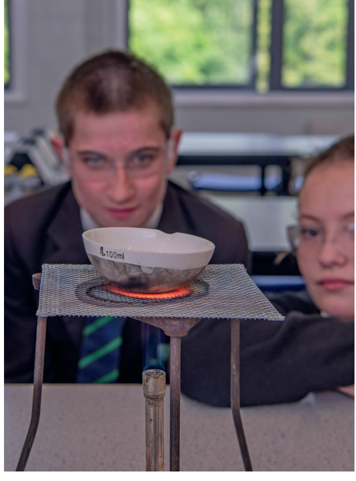
Many parents, staff and pupils commented on the rapid improvements made by leaders since the last inspection. Some described the school as having been "transformed" (Ofsted 2022)