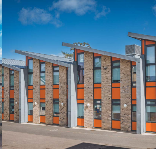
Senior School: Robinson building

Over the months ahead, we will be developing and sharing more about our move to offer education for children Age 3 to GCSE