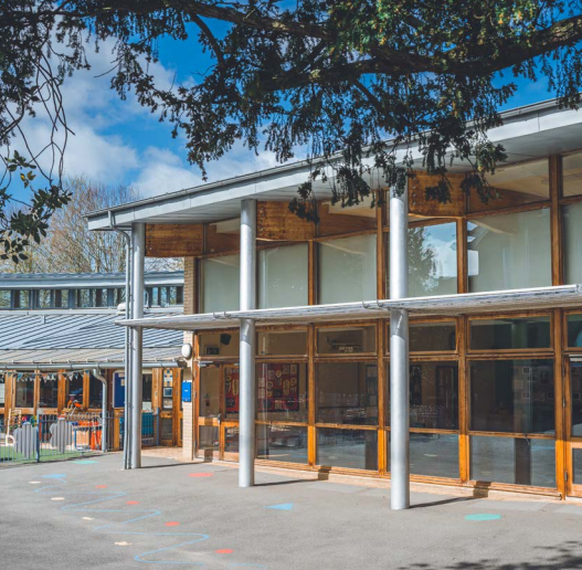
Junior school: Rowan building