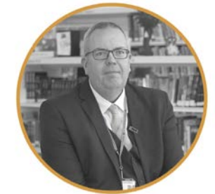
play | POSITIVE CONTRIBUTION MR COOK

We are very proud of our students who leave Formby High School as young adults equipped with the skills, qualifications, determination and confidence to succeed in life, and make a difference to the communities they serve.