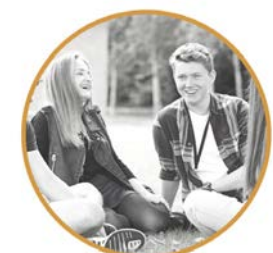
>play | SIXTH FORM VIDEO