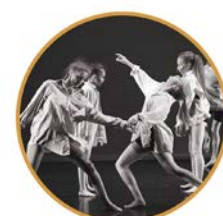
play | PERFORMANCE HIGHLIGHTS