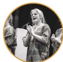
play | EXTRA CURRICULAR MR COOK

Students have travelled as far afield as the First World War battlefields of France and Belgium, Berlin, Krakow in Poland, Italy for skiing, Iceland to study the geographical landscape, the Caribbean for sporting competition, and Spain and France to enhance the learning of foreign languages. Our annual Year 7 residential is very popular amongst our younger students!