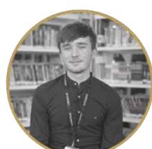
play | CREATIVE ARTS STUDENTS