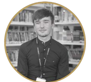
play | STUDENT LEADERSHIP STUDENTS