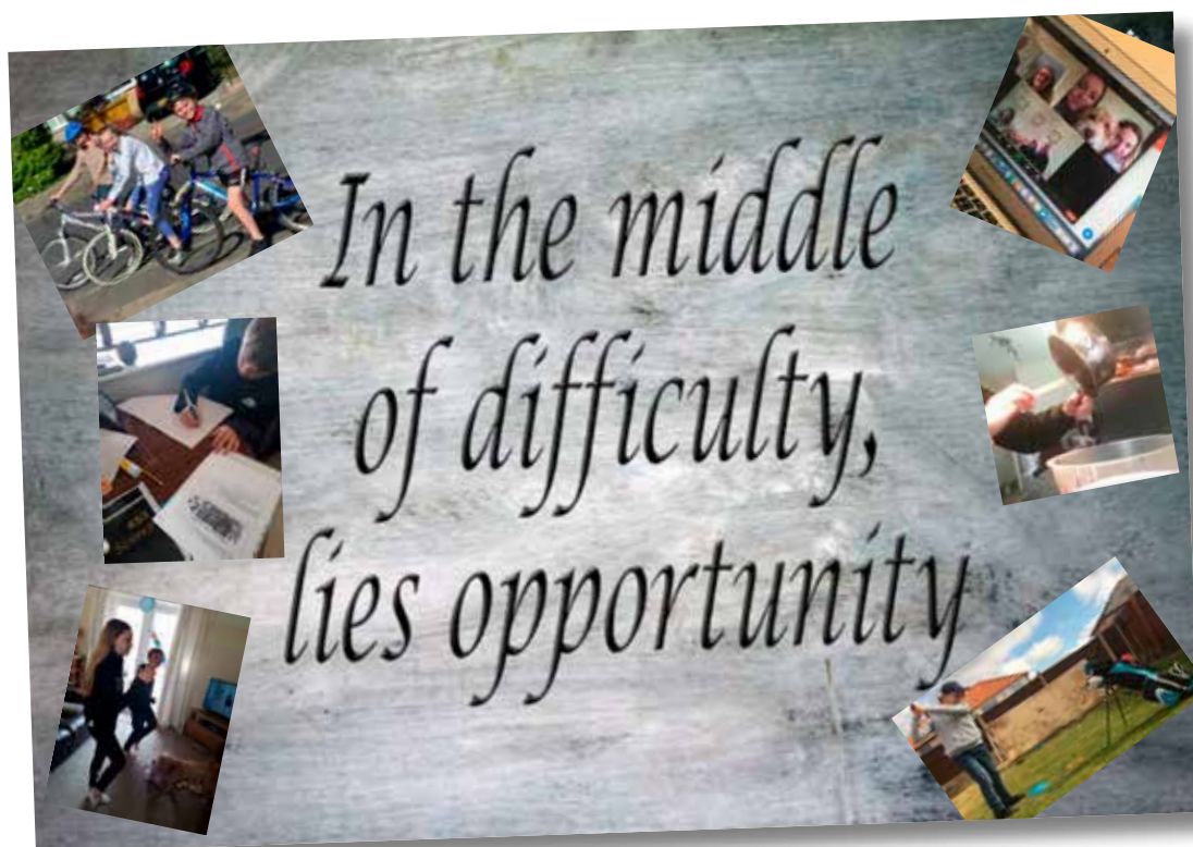
Collage by Thomas Bluck