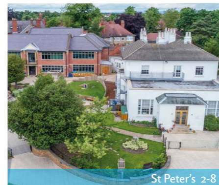
St Peter's 2-8