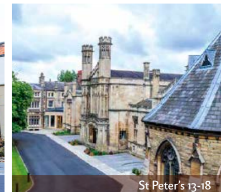
St Peter's 13-18