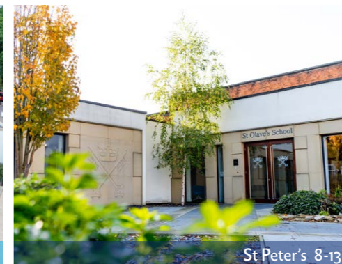
St Peter's 8-13