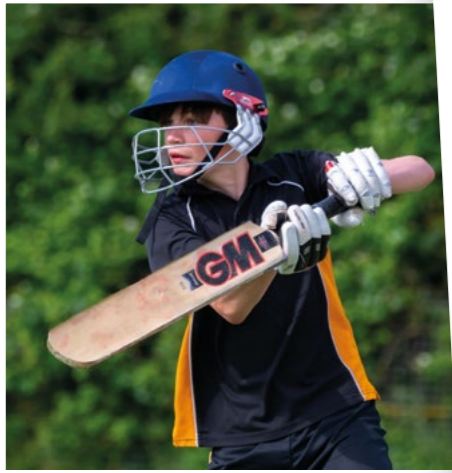
Sports and competition