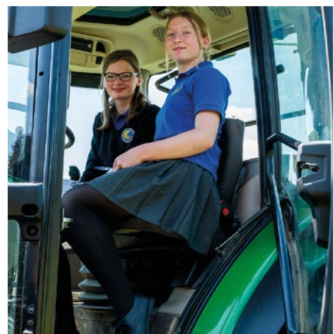
Rural Economy Careers Day