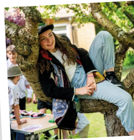
Drama Club 'Between the Pages'