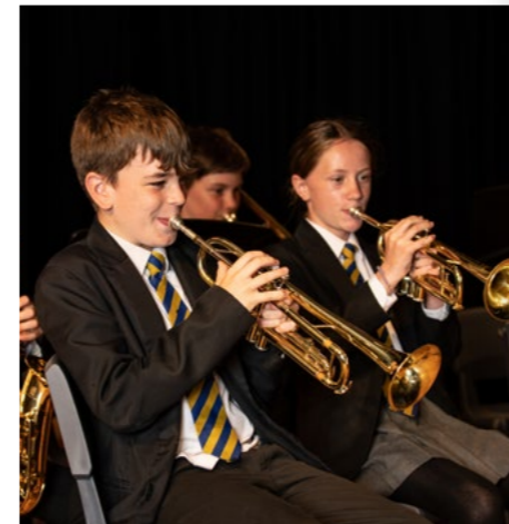
Music and performance