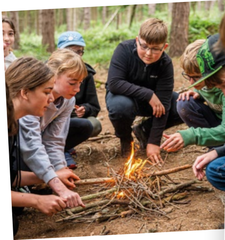
Year 7 'Bushcraft' residential trip