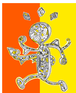
ACTIVE LEARNER Involved Questioning

We place a strong emphasis on developing and embedding habits for learning. Fostering independence, collaboration and the ability to consider different perspectives are crucial skills for pupils, not only during their time at school but also for their lifelong learning journey.