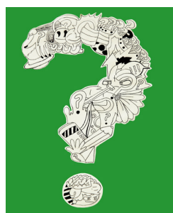
CRITICAL THINKER Creative Reflective