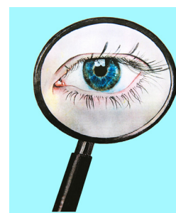
EXPLORER Risk Taker Resilience

Teaching pupils to be learners for life is a transformative approach. It instils a growth mindset, a love for learning and an understanding that education is not limited to the confines of a classroom or a specific time. By nurturing curiosity, adaptability and a hunger for knowledge, we are equipping pupils with the tools to embrace continuous learning and thrive in an ever-evolving world.