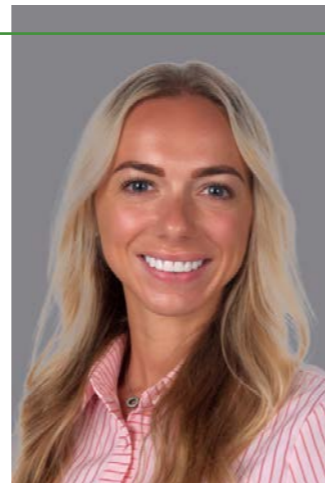
Gabrielle Lake Secondary Behaviour Coach

I am proud to be part of a school that not only strives for the highest standards but also nurtures the people within it. DIS has shaped me, developed me, and continues to challenge me in the best possible way.