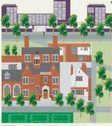
PRENDERGAST SCHOOL & PRENDERGAST SIXTH FORM Duckley