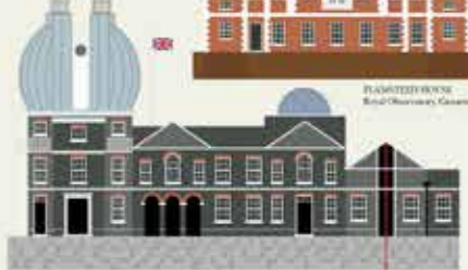
ROYAL OBSERVATORY Greenwich