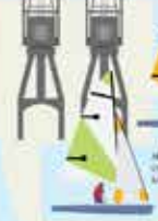
CARLEY WATER Isle of Dogs