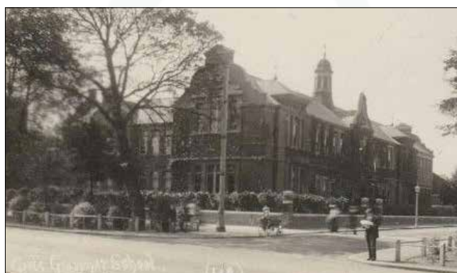
Prendergast Grammar School for Girls

"And as to all the residue of my estate and effects whatsoever consisting of pure personalty I give and bequeath the interest and income thereof unto my said wife and her said sisters for their joint lives and life of the survivors and survivor of them. And after the decease of such survivor, I give and bequeath the said residue to the Vicar and Churchwardens for the time being of the Parish of Lewisham for the endowment and support of a Grammar School for Girls in the Parish of Lewisham."