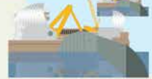
THE THAMES RIVER Clubhouse