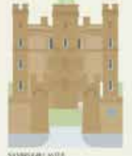
SAUNDERS CASTLE Maze Hill