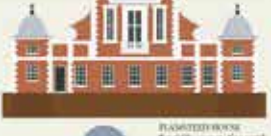
PLANTERS HOUSE Royal Observatory, Greenwich