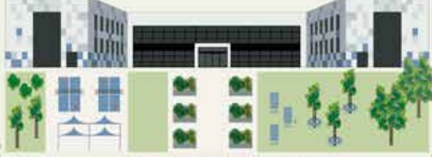
PRENDERGAST LADYWELL SCHOOL Lewisham