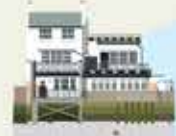
RIVER THAMES FERRY Wapping Wall