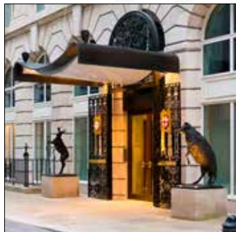
The Leathersellers' Livery Company