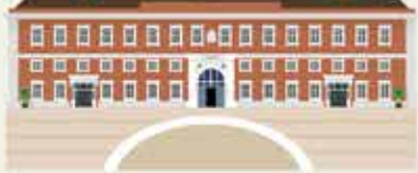
GOVERNMENT UNIVERSITY ACCADEMY New Cross