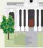
ST PAULS CHURCH Deptford