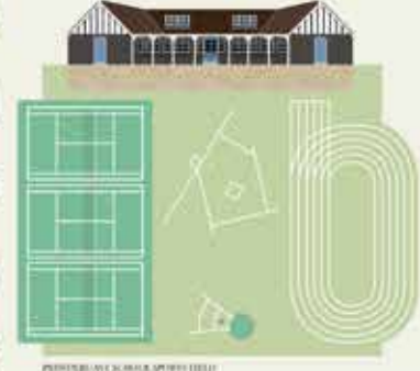
PRENDERGAST SCHOOL SPORTS FIELD Ashington