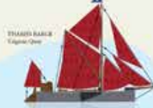
THAMES RAZE Eggar Quay