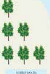
RIVER DOCKS Rotherhithe Quay