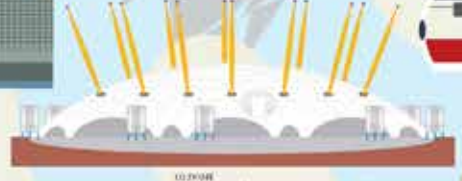
CRUISE Greenwich Peninsula