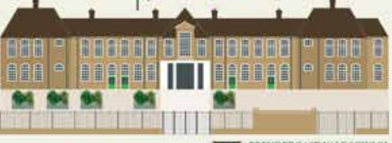
PRENDERGAST VALE SCHOOL Lewisham