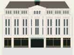
SEASIDE THEATRE Culver