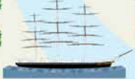
CITY AFB Greenwich