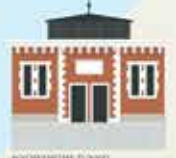
RIVER THAMES TUNNEL Rotherhithe