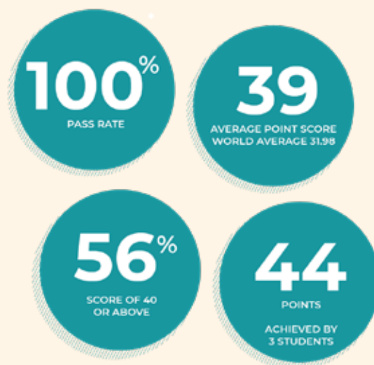
IBDP Results 2022

The IBDP is a rigorous, academically challenging and balanced programme designed to prepare students for success at university and life beyond. It is one of the most prestigious international qualifications available, respected and sought after by the world's best universities. A core focus of the IB curriculum is to develop internationally minded young people, and encourage critical thinking and continuous self-reflection, both in academic courses and through extra-curricular activities.