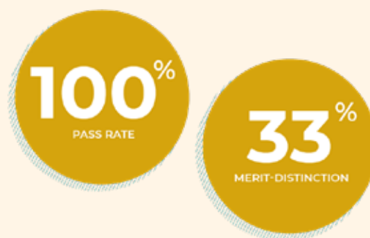
BTEC Level 2 International Diploma in Business Results 2022