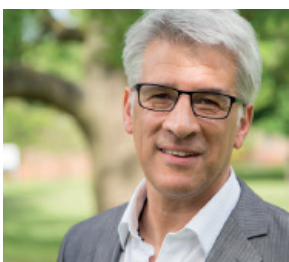
Steve Chalke, MBE

We look forward to welcoming you and your child to an Oasis Academy in order to experience this for yourself.