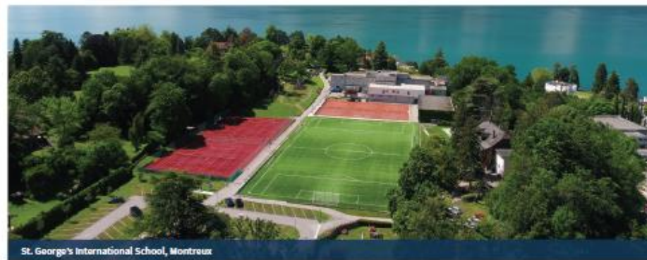
St. George's International School, Montreux