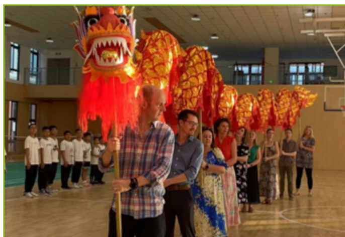
Xiang'an Experimental School Vist – page 13