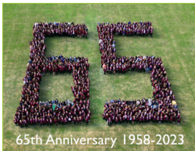
TPS at 65 – page 20