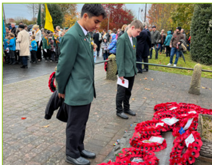
Armistice Day – page 18