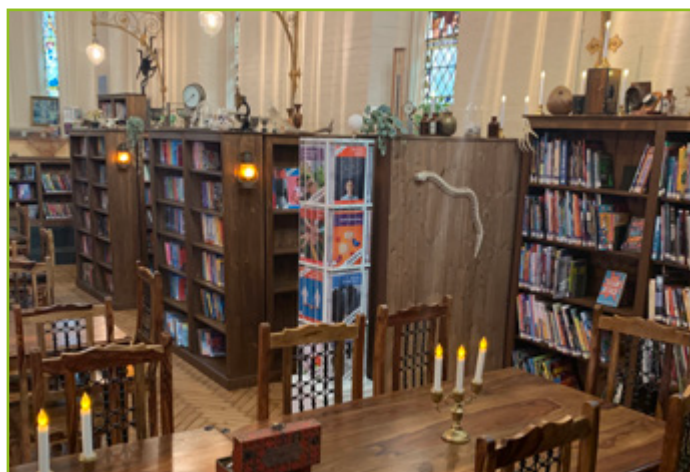
Priory's Library – page 25