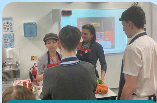
Year 9 Chinese Cookery Workshop. (Turner Free School)