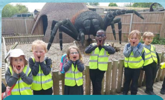
Year R and 1 pupils visited Wingham Wildlife Park. (Martello Primary)