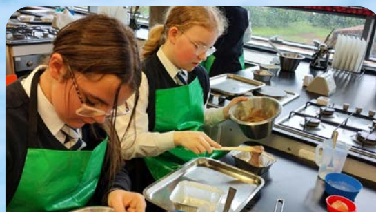
Year 8 pupils developed their cooking skills. (Folkestone Academy)

ill complete at each of our schools. The Turner 25 ens and forge links with their local community and opportunities beyond the classroom to establish their