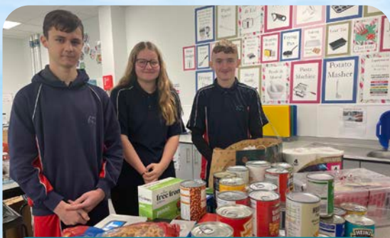
Year 10 organised a charity event for Folkestone Rainbow centre. (Turner Free School)

Turner 25 is a list of 25 activities that all pupils will complete. The programme aims to encourage pupils to become active citizens and to think beyond. The programme provides pupils with opportunities to develop their identity and prepare them fully for their futures.