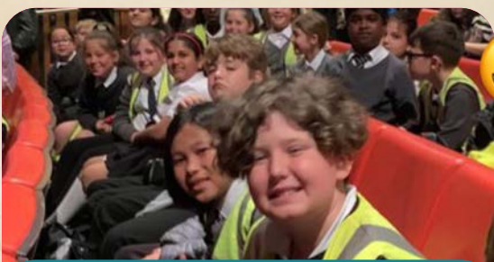
Year 5 pupils watched a musical performance at the Marlowe Theatre. (Martello Primary)