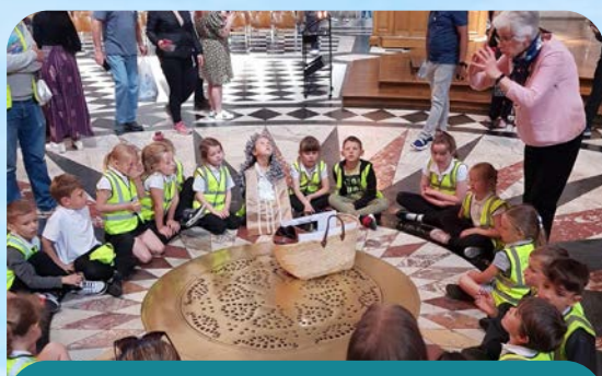
Year 2 pupils visited St Paul's Cathedral in London (Martello Primary)