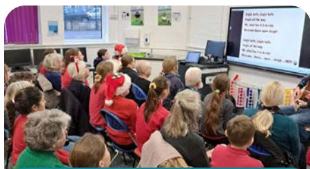
Singing with local care homes