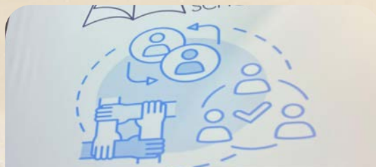
Peer Mentoring Training- T25