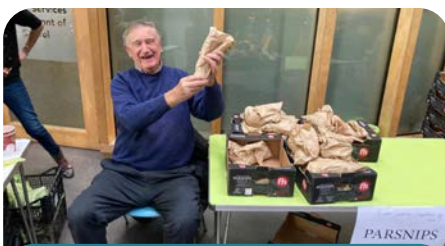
Christmas Food Hampers