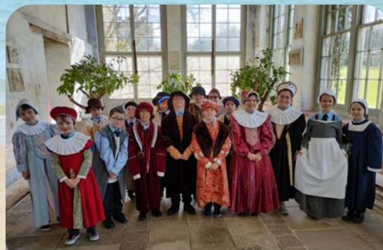
Year 5 pupils visit Knoke Park. (Folkestone Primary)