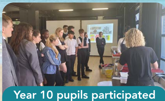
Year 10 pupils participated in Creative Folkestone art workshop.