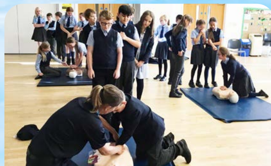
Year 6 pupils took part in a Restart a Heart CPR workshop. (Folkestone Primary)