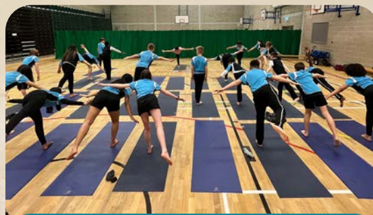
Year 7 and 8 pupils took part in well-being Yoga classes to promote mindfulness. (Folkestone Academy)