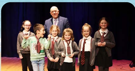
Pupils took part in their school Talent Show and went on to win the Murphy Prize at Turner's Got Talent! (Morehall Primary)