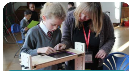
Diversity and Inclusion Week