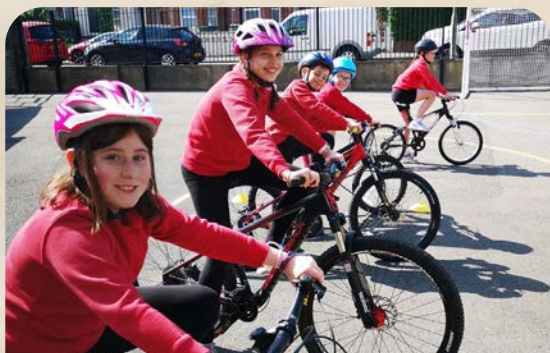
Year 5 pupils completed the 'Bikeability' course. (Morehall Primary)