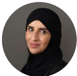
DHABIA AL MULLA AL AZM SCHOOL