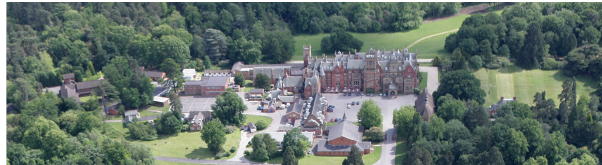
Reddam House, Berkshire