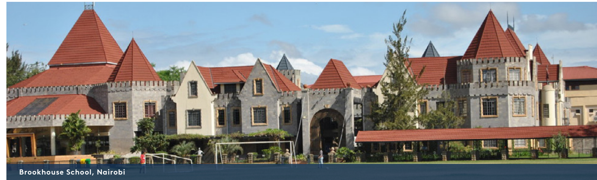
Brookhouse School, Nairobi