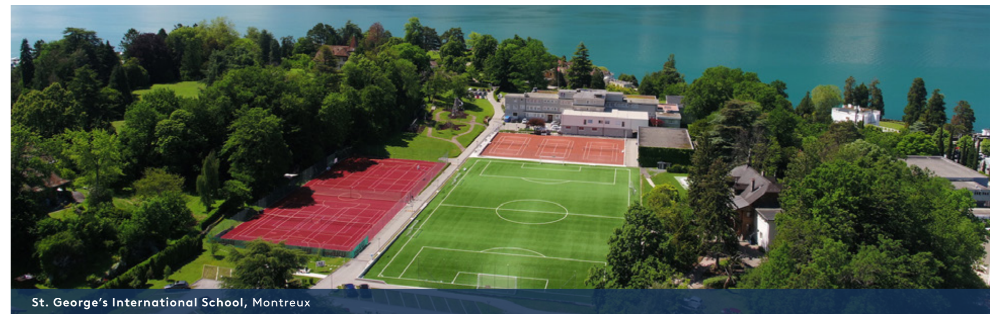
St. George's International School, Montreux