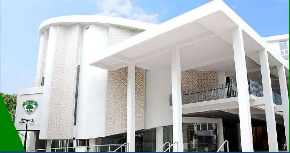
NHA BE CAMPUS