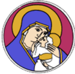
Our Lady & St Paul's RC Primary